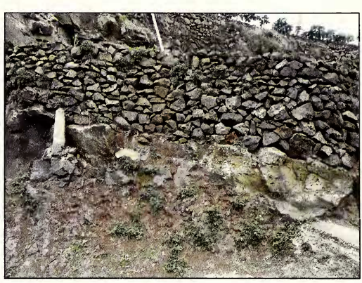
walls with Parietaria judaica.

of the leaves. The occupied plants were mostly growing isolatedly in rock and stone niches on at least partially sunny ground. Pupation took place in captivity between the end of December and January; all pupae (n = 12) entered dormancy and moths did not emerge until late April and May 2012.